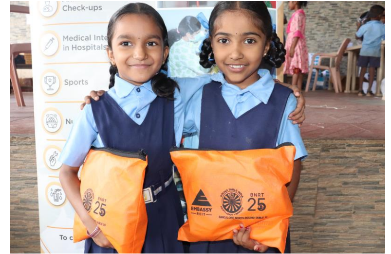
Preventive Health Kit Distribution