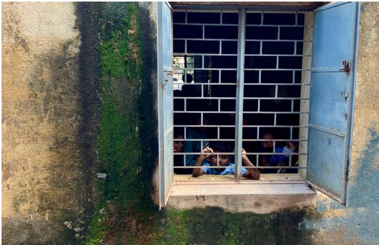
Broken windows and seepage within classrooms in a school