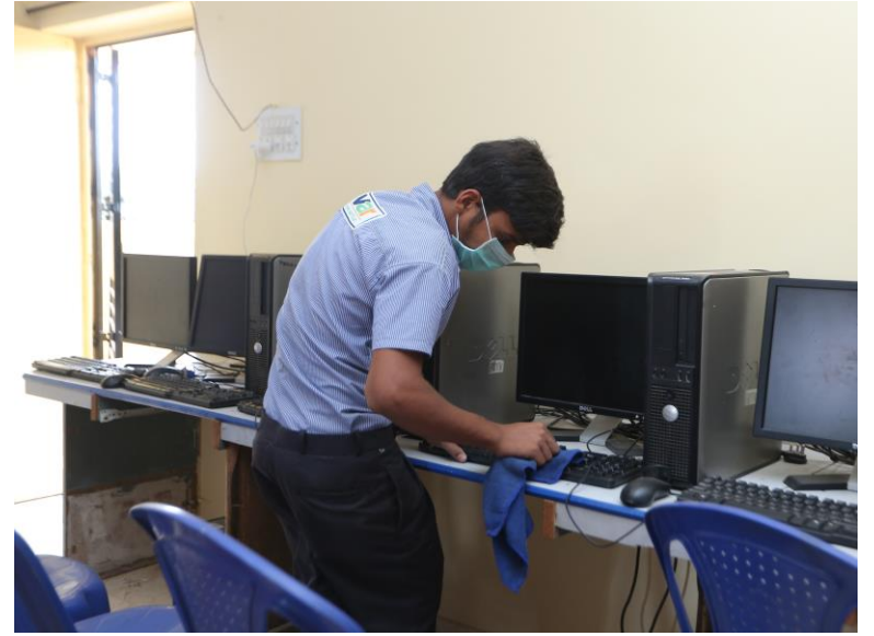
Daily School Maintenance of Solar, Toilets, Classrooms, RO Units and Resources