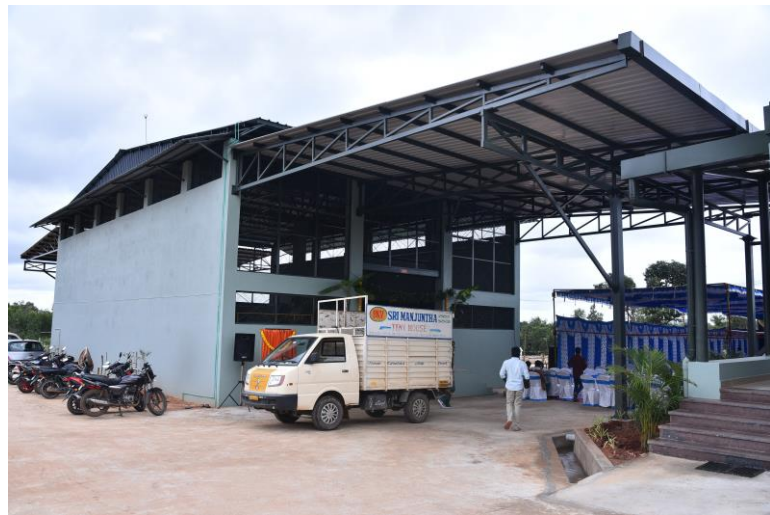
Dry Waste Collection Centre