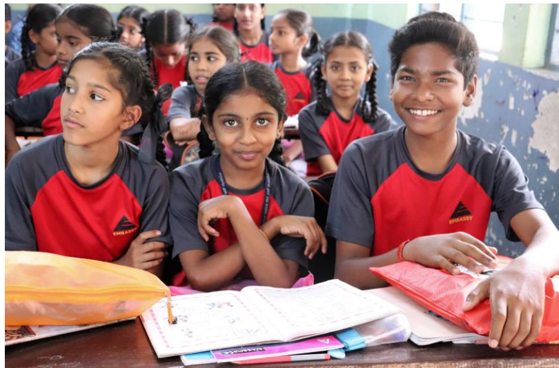
Life Skills Lessons