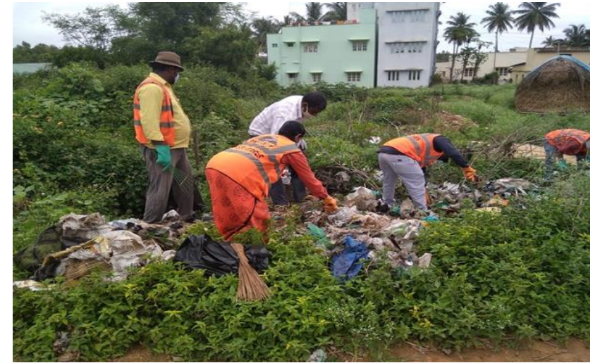
Clean Up Drives