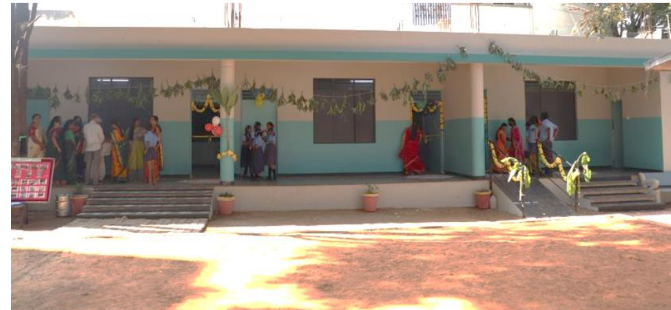
2021 New Building - 3 classrooms, 1 Anganwadi with Kitchen