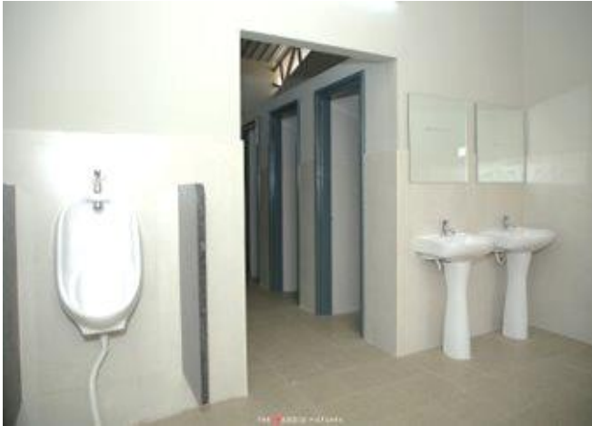
Renovated Toilet Blocks at Government Schools