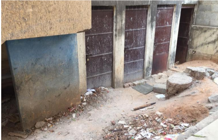
Unusable toilet block in a Government School