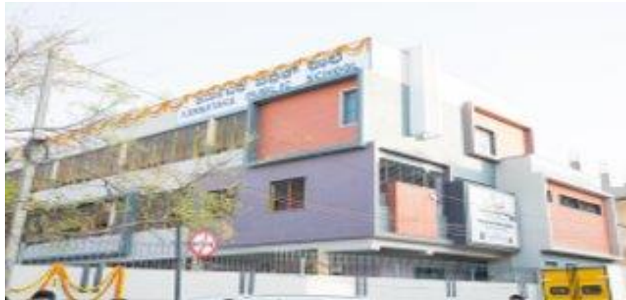
2020 New School Building