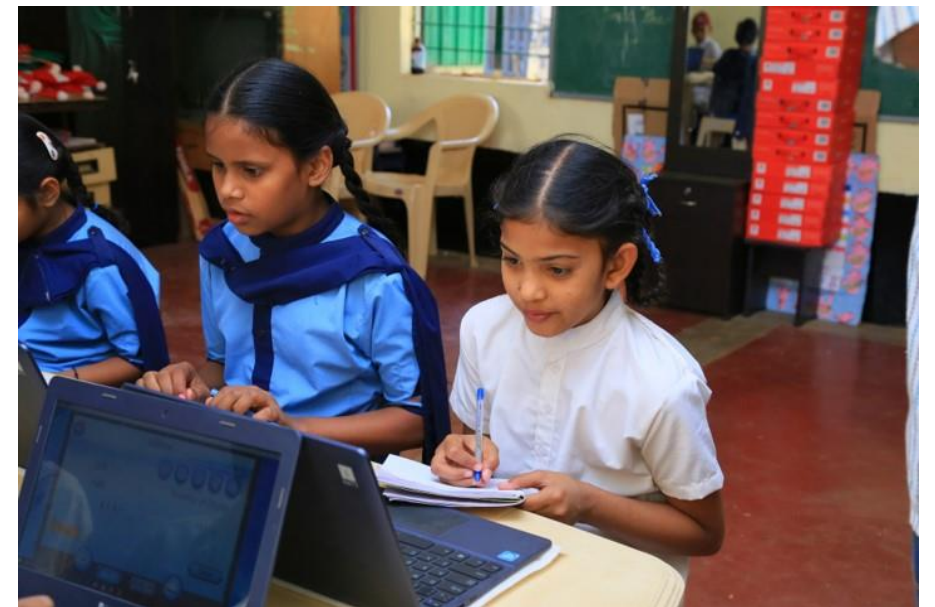
English and Math Lessons