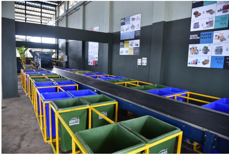
Dry Waste Collection Centre