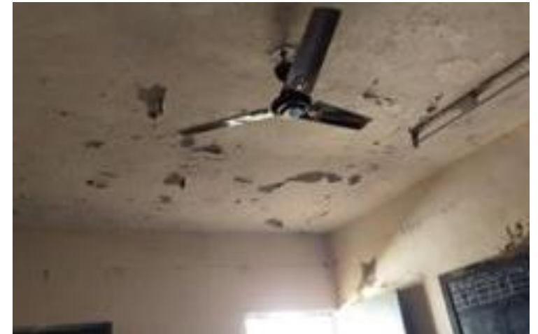
Water seepage and chipped roofing in a classroom