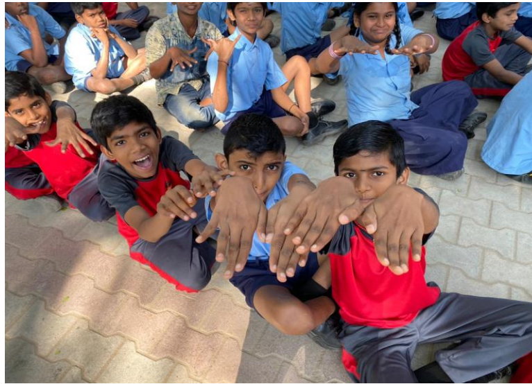
Preventive Health Awareness