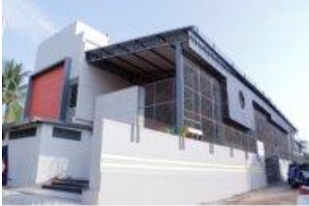
2019 New School Building