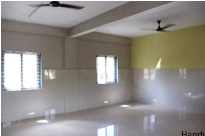
Roofing, Tiling and Painting of Classrooms