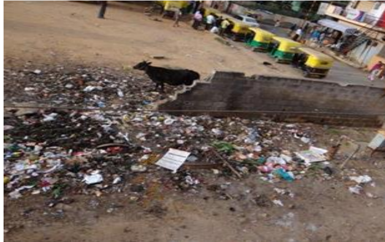
Garbage dumped and broken compound wall in a Government School