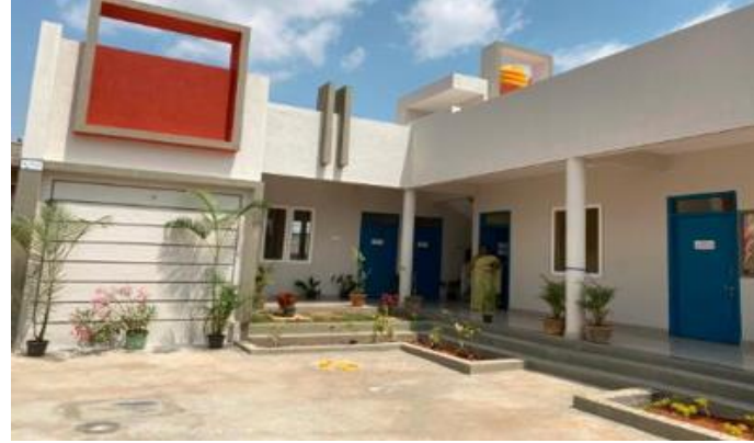
2020 New School Building