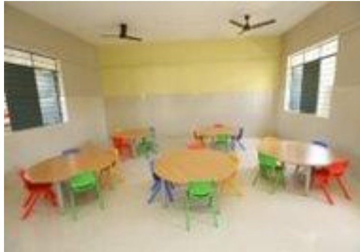
Fitout for Nali Kali Room