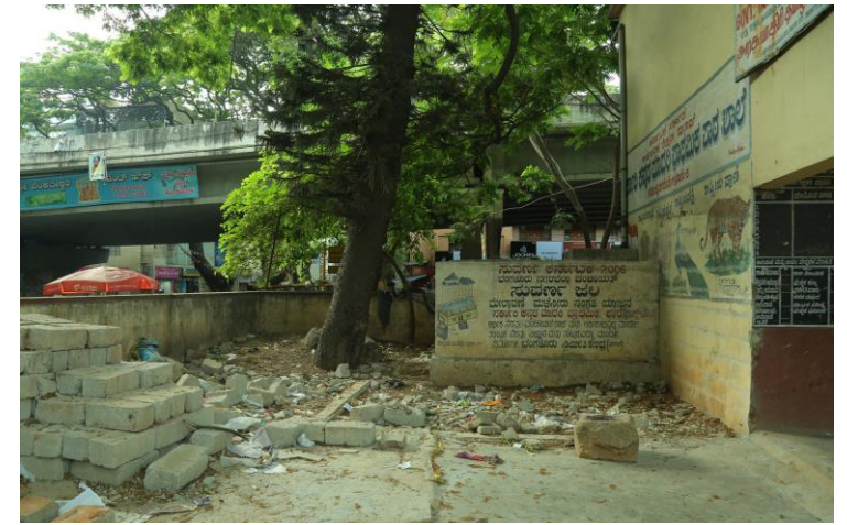
Debris and garbage within a school compound