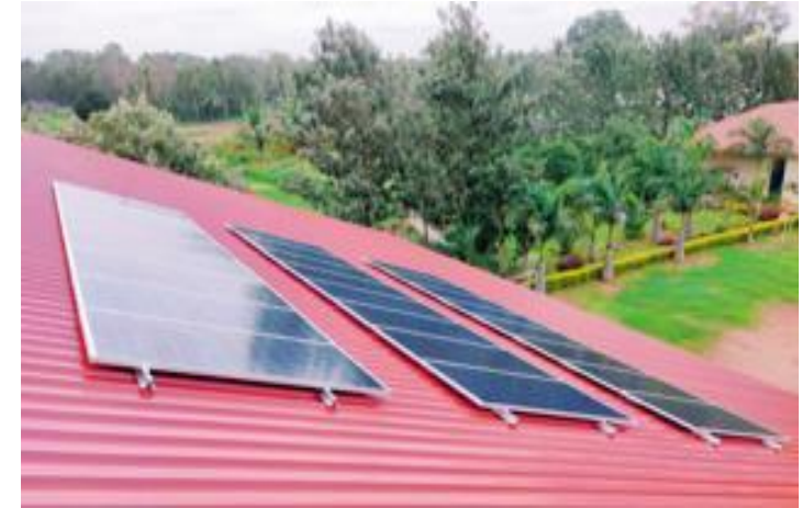
Solar Panels in Government Schools