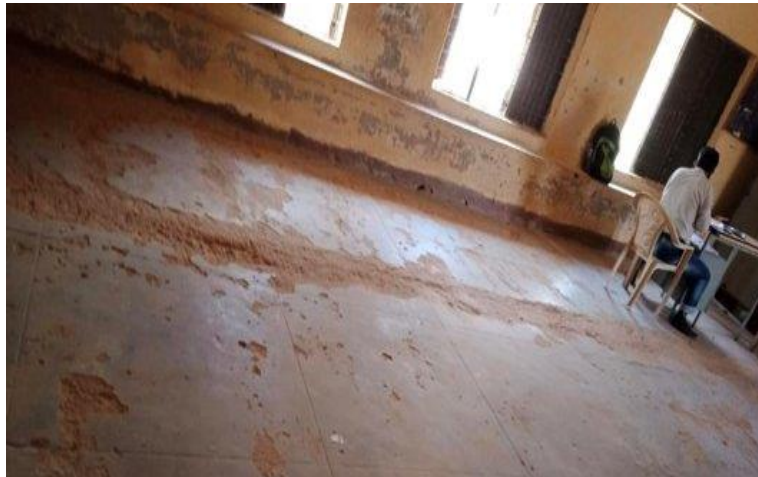
Chipped and broken floors within the Government Schools