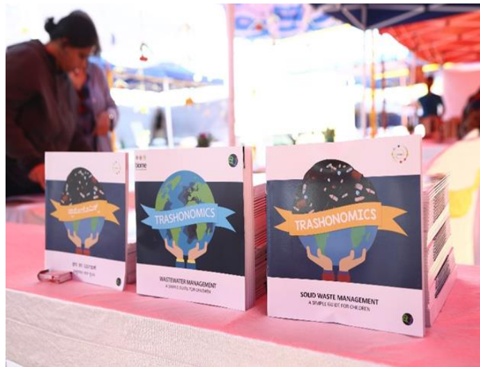
Trashonomics for govt. school students