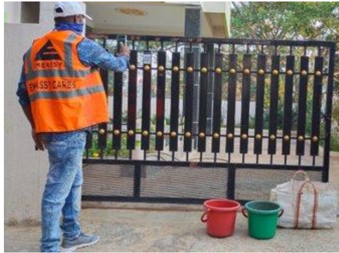
Waste Management through QR Codes