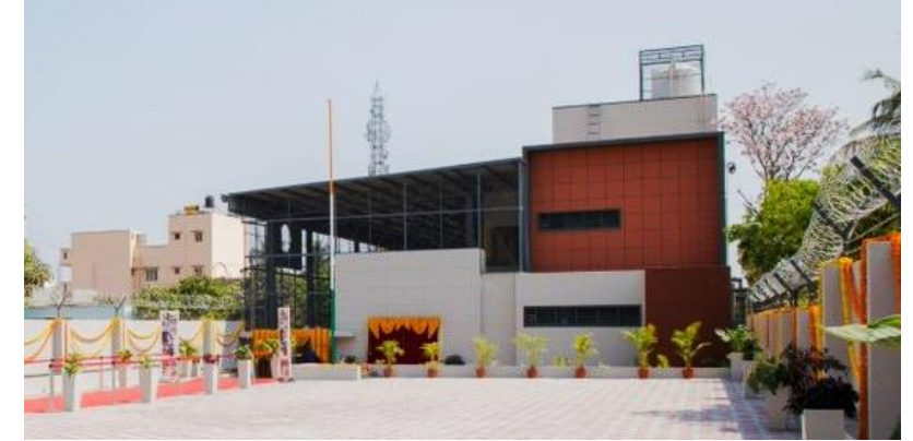
2020 New School Building