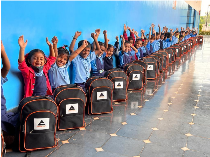
Distribution of Learning Resources